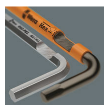
L-keys made from circular material fit into the hand better and allow less strenuous work over a longer period. Additionally, the rubber sleeve provides a pleasant grip, particularly in applications at low temperatures. Colour coding and large stamp enable the desired Lkey to be easily located. Moreover, the round material keys are more robust, particularly where smaller sizes are concerned.